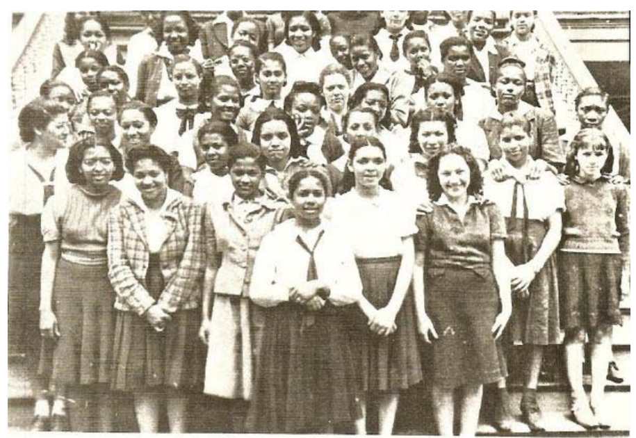
1938-39 SEssion Boarders and Day Pupils

"First, free women of color whose parents could afford it, were educated in France or in New Orleans by the Ursulines. Second, Catholic missionaries from Holland and Germany began migrating to the United States. Both groups began work among Native and African Americans in Louisiana and Texas. It is through the efforts of German missionaries that Holy Rosary Industrial School for girls began in Galveston in the 1880"s and in Lafayette in 1913.